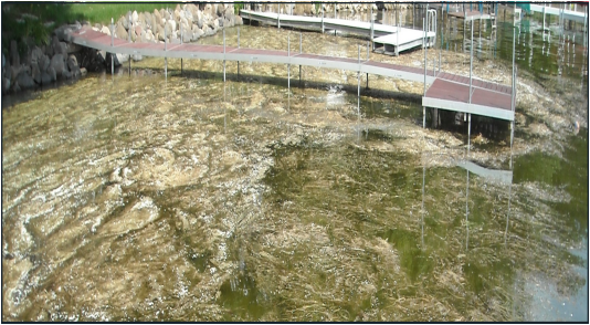
Native sago pondweed can form dense mats inhibiting navigation

Weed harvesting commenced on July 14th. Greater ice cover this winter may have led to slow initial growth of our early growing aquatic plants such as the invasive curly leaf pond weed. As in years past, this plant dies and decays becoming nutrient fuel for other aquatic plants.