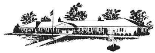
James R. Ryan Municipal Building

5635 S. New Berlin Road Hales Corners, WI 53130 Phone: (414) 529-6161 www.halescornerswi.gov