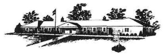
James R. Ryan Municipal Building

5635 S. New Berlin Road Hales Corners, WI 53130 Phone: (414) 529-6161 Fax: (414) 529-6179 www.halescorners.org