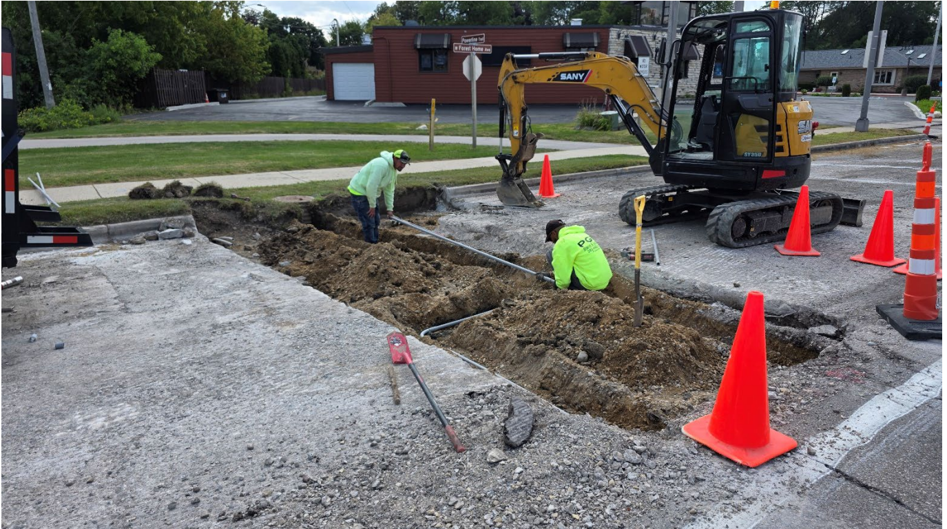
Installing conduit in the median for traffic signal interconnect