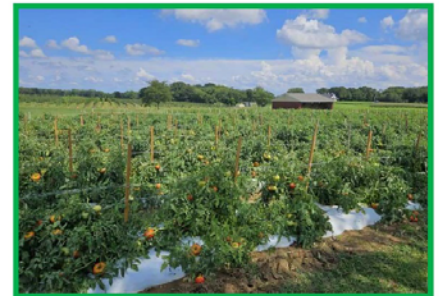
Applegate Acres, ~36 acres preserved

the report, visit www.nj.gov/agriculture/sadc/nextgen/