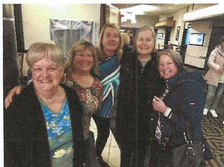
Klub 55 Matinee movie