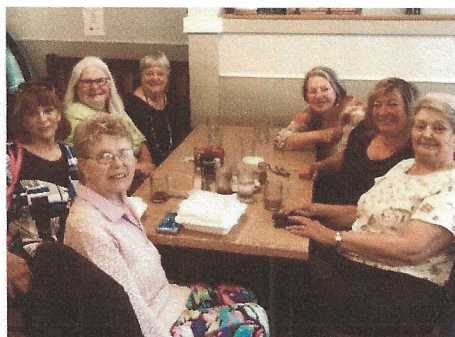
Breakfast Klub at Red Shorts Café