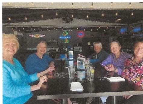
Lunch at The Garage BBQ Pit and Saloon