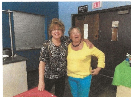
Lunch at the Village Hall