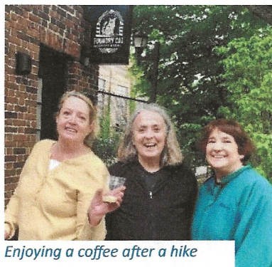
Enjoying a coffee after a hike