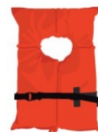
TYPE II: NEAR-SHORE BUOYANT VEST Minimum 15.5 lbs of buoyancy, designed to turn and unconscious person face-up.