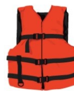
TYPE III: FLOTATION AID Minimum 15.5 lbs of buoyancy, not designed to turn and unconscious person face-up; more comfortable for water sports.