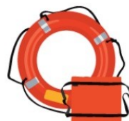
TYPE IV: THROWABLE DEVICE Minimum 16.5 lbs of buoyancy, designed to be grasped, not worn.