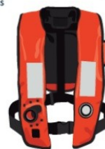
TYPE V: SPECIAL USE DEVICE Must be used in accordance with any requirements on the approval label.