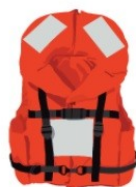
TYPE I: OFF-SHORE LIFE JACKET Over 20 lbs of buoyancy, designed to turn an unconscious person face-up.