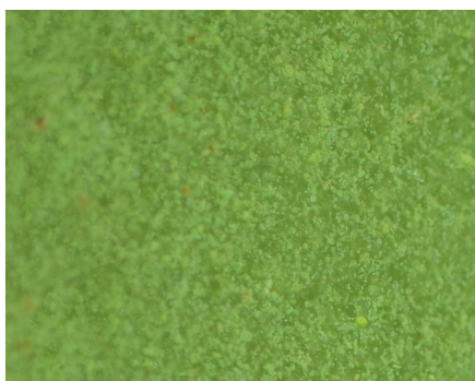
Has small green dots floating in it