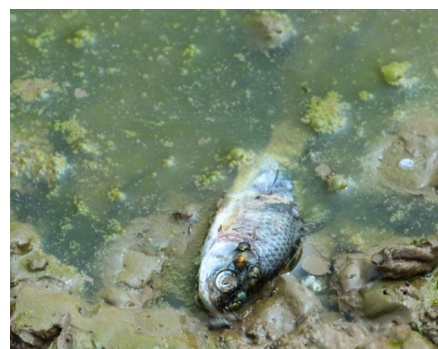
Has dead fish or other animals