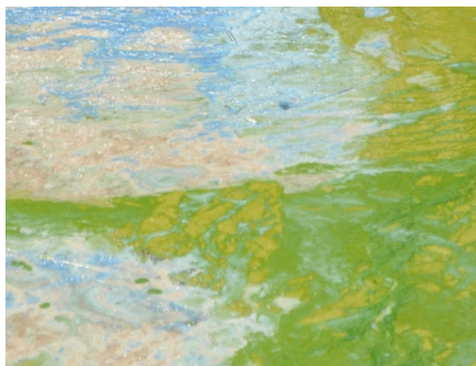
Looks like spilled latex paint