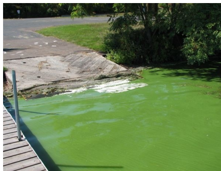
Looks like green pea soup