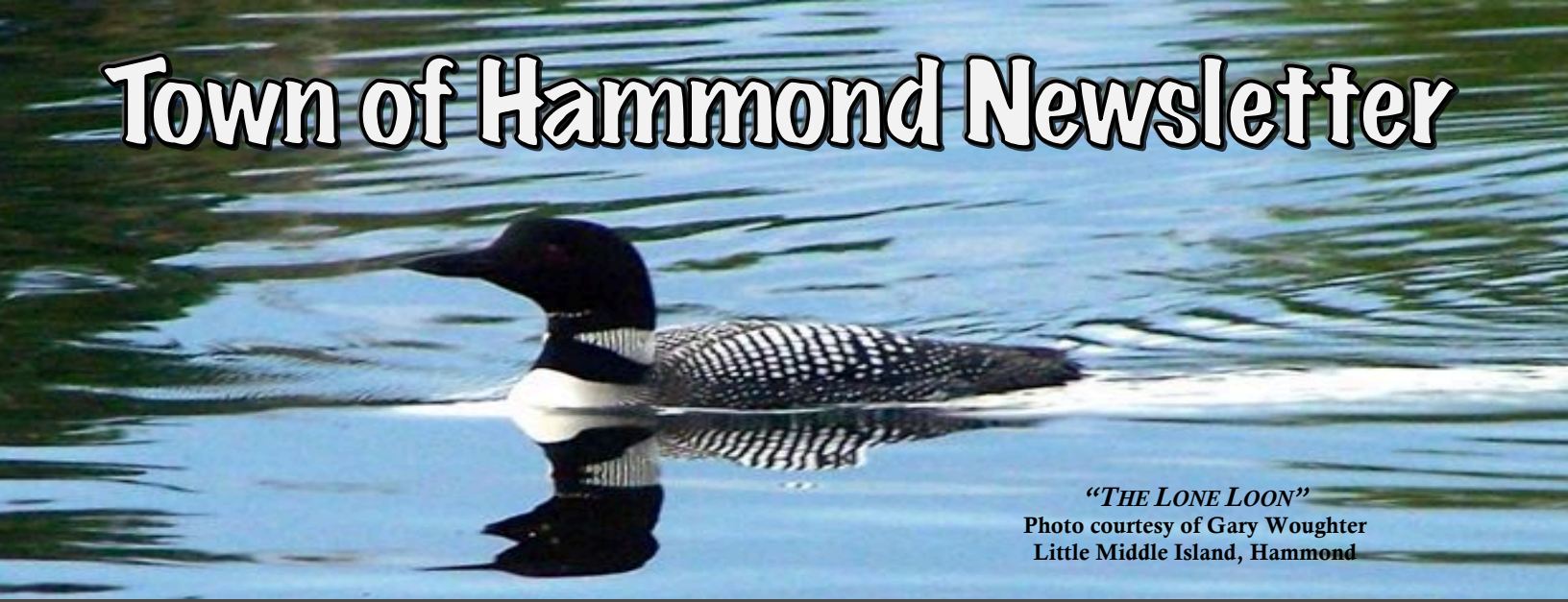
"THE LONE LOON"

Little Middle Island, Hammond