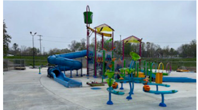
War Vets Park - Splash Park Dates/Times TBA