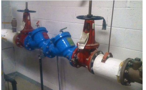
Figure 3 - Example of a Backflow Prevention Assembly