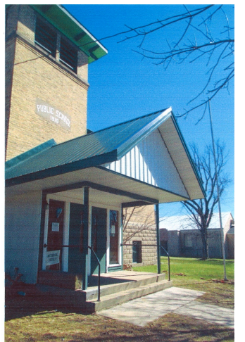
FHS Roof construction completed!