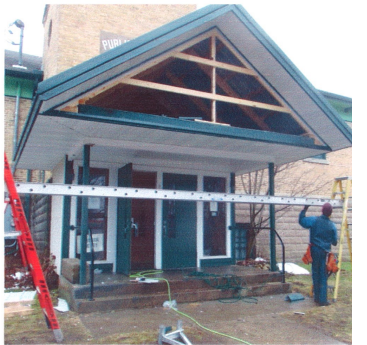
Finishing the job: Replacing FHS entranceway roof.