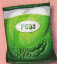
FROZEN FOOD BAGS