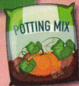
MULCH OR SOIL BAGS