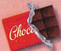
CANDY BAR WRAPPERS