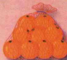
NET OR MESH PRODUCE BAGS