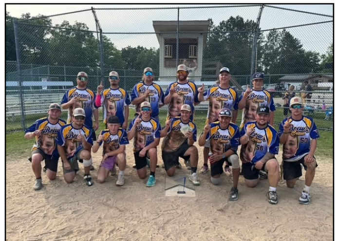
46th Annual Softball Tournament Winners - Brew's Pub