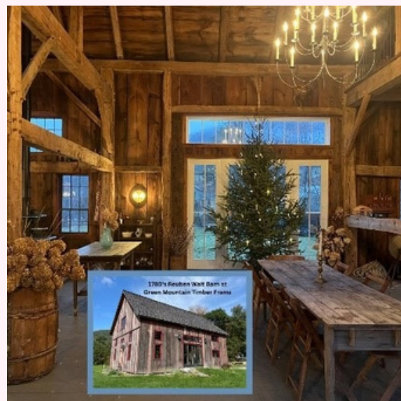
One of the items in the Middletown Springs Historical Society's Maple Raffle is an event rental for up to 30 people at the 1780s Reuben Wait Barn at Green Mountain Timber Frames in Middletown Springs.