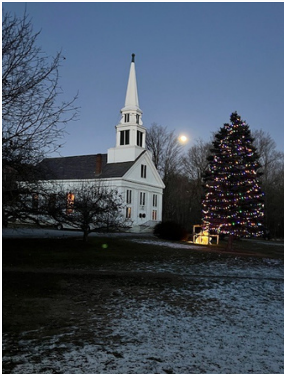
Middletown Springs Church