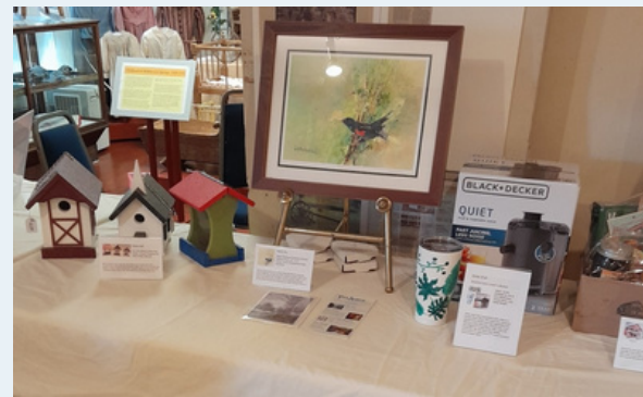
An example of raffle items from a previous maple festival. Photo provided.

All donations are tax-deductible, based on your estimate of value.