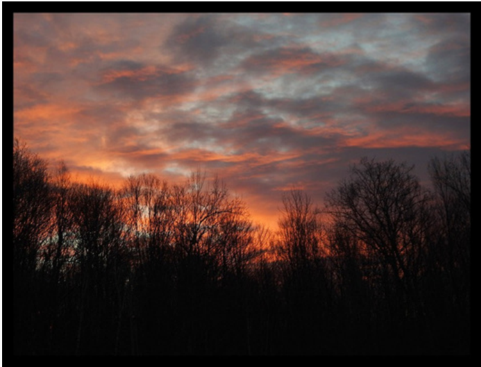
Early Morning Eastern Surnise over Middletown Springs

PH: 802-235-2220 | Email: middletown@vermontel.net The town clerk's office is closed every Wednesday and on all federal holidays