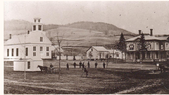
The Middletown Springs Town Green Circa 1870.