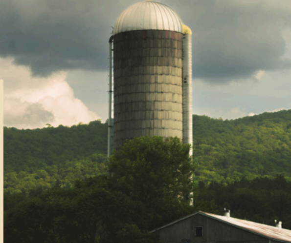
Banner photo by Benjamin Riffin