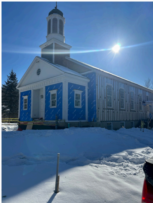
New library building in progress.