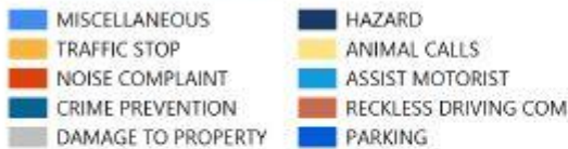
Top 10 Calls for Service By Type