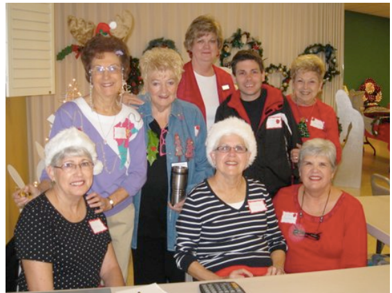
Everything Christmas Bazaar