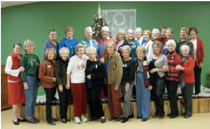
Ladies Club Christmas Party