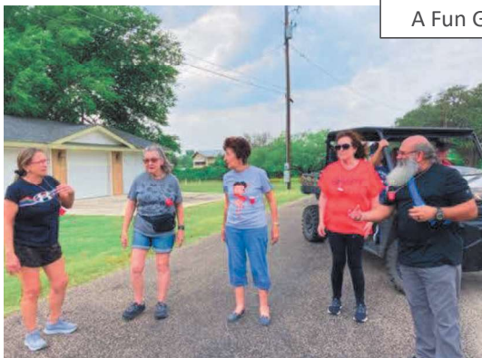
A Fun Game Of Bosseln