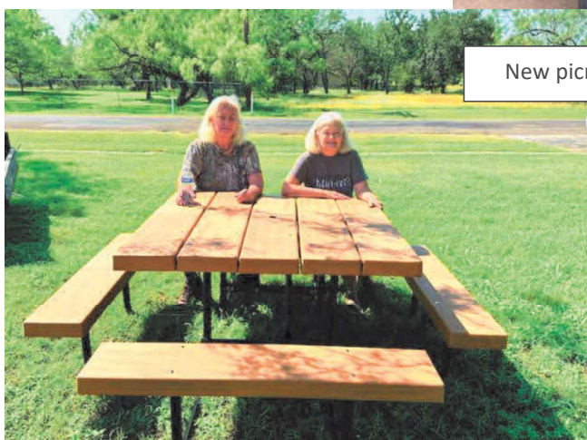
New picnic table