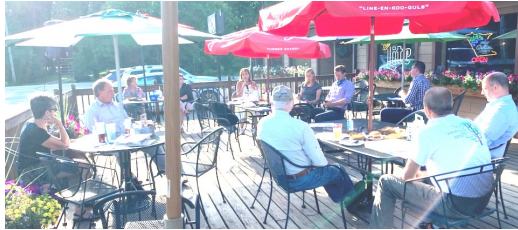
Public information kick-off meeting in July

Most importantly I want to draw the community's attention to the survey that