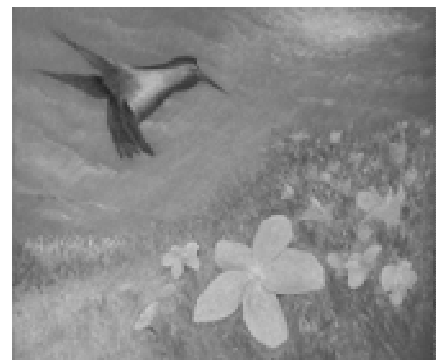
“After the Shower” Brian Higgins