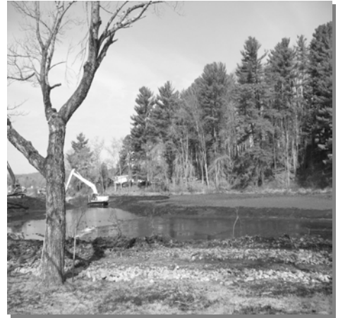
Dredging the lake side pond