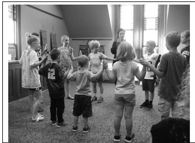
The Springfield Museum of Science's "It's Electric!" program