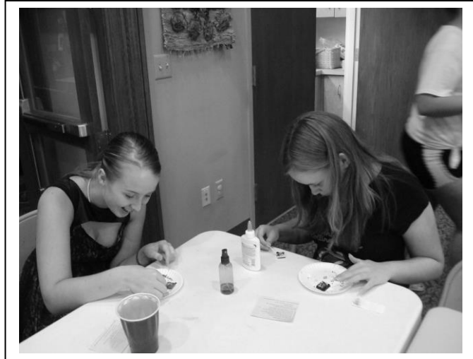
Two teens try their hands at making their own glass pendants

The Library would like to thank the following sponsors for making the 2016 Collaborative Summer Library Program possible: