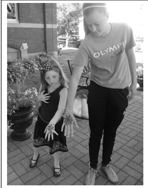
Two patrons show off their henna creations