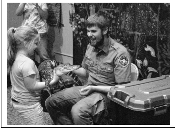
A young patron makes a scaly friend