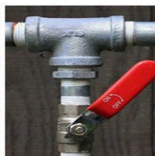
Galvanized Steel & valve