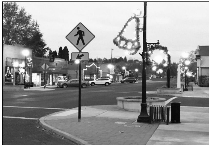
All black and white photos in this issue courtesy of Kathy Thew.