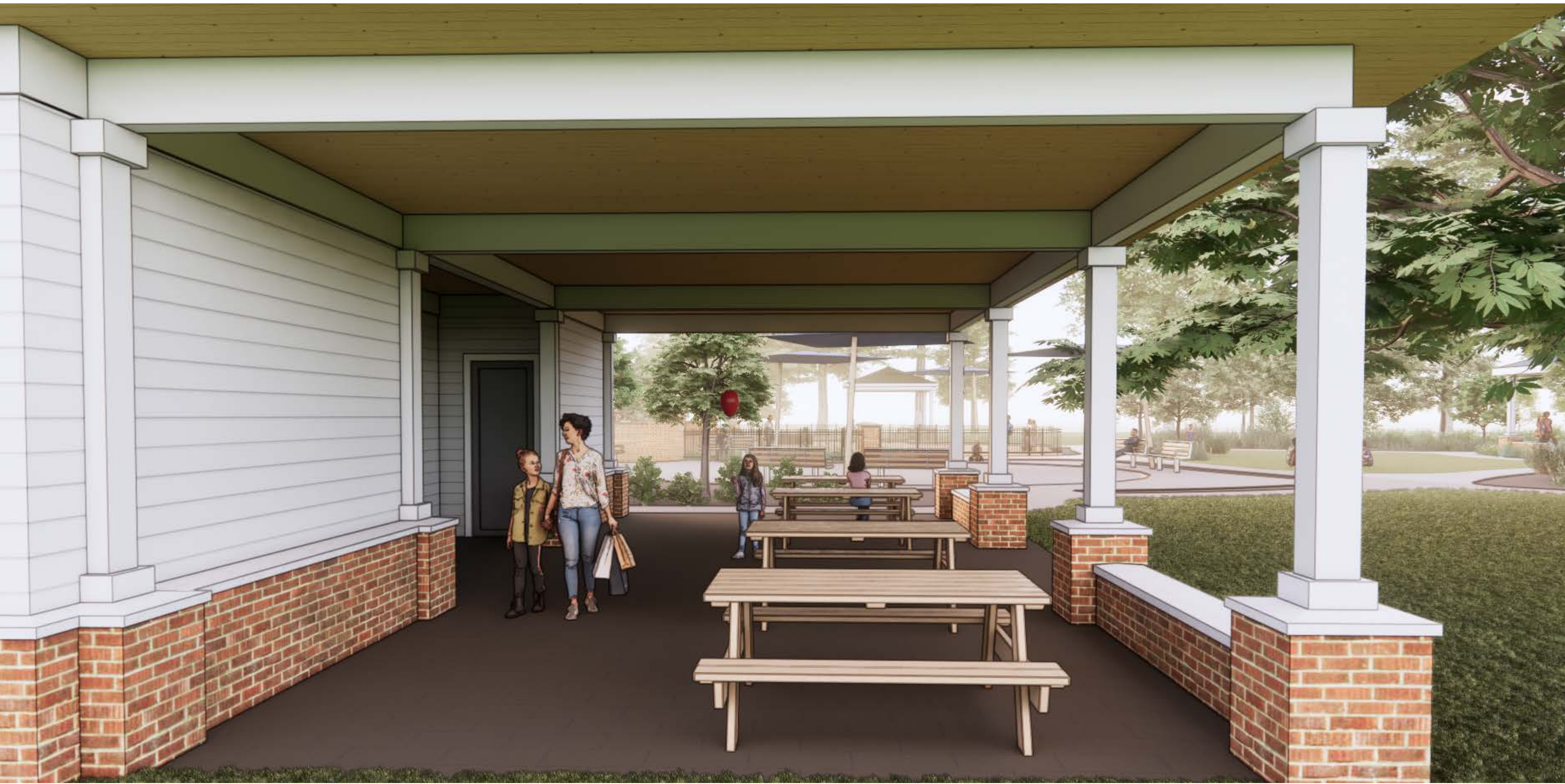
RESTROOM VIEW AT COVERED PATIO