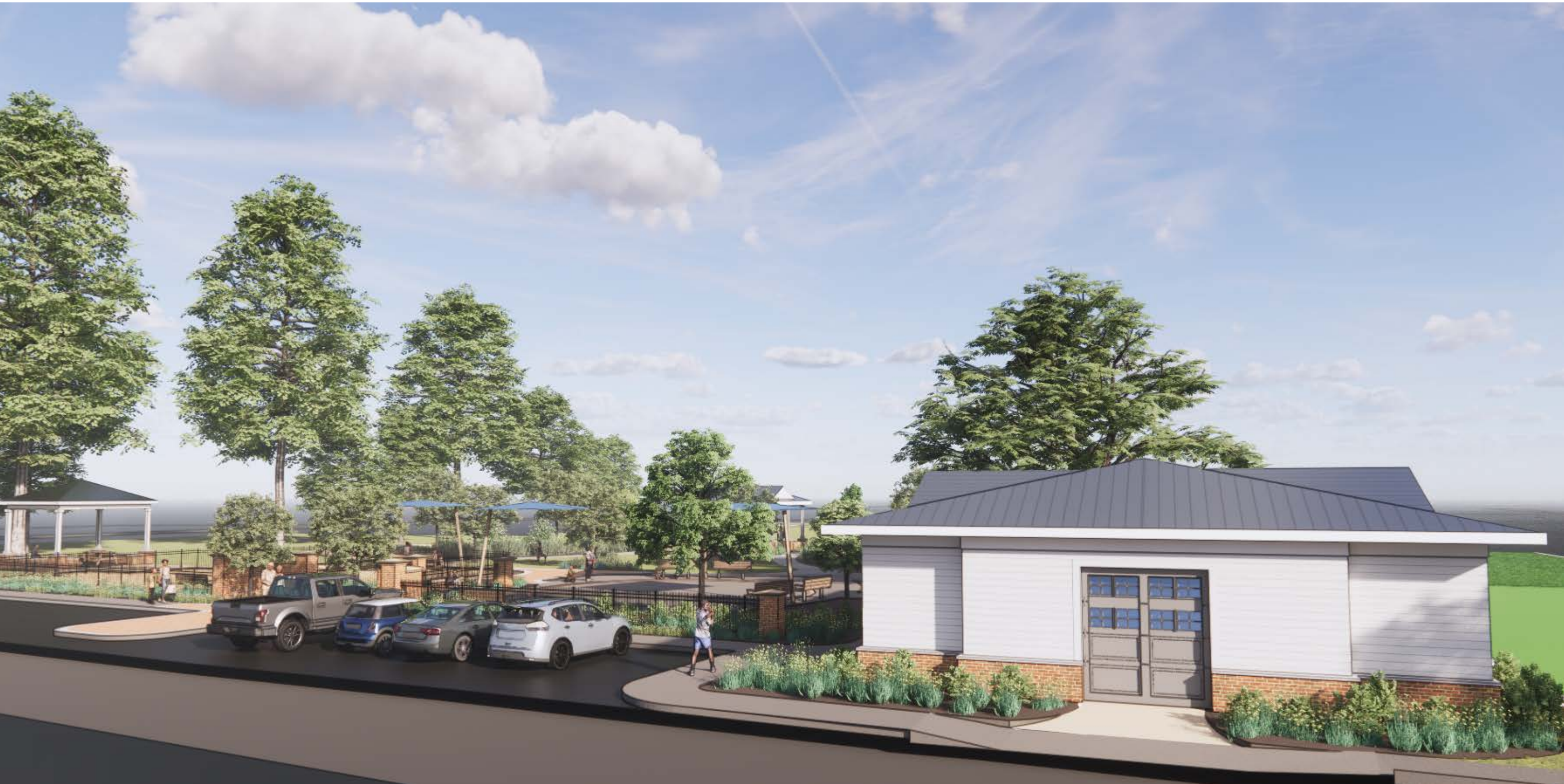
RESTROOM VIRGINIA STREET FRONTAGE