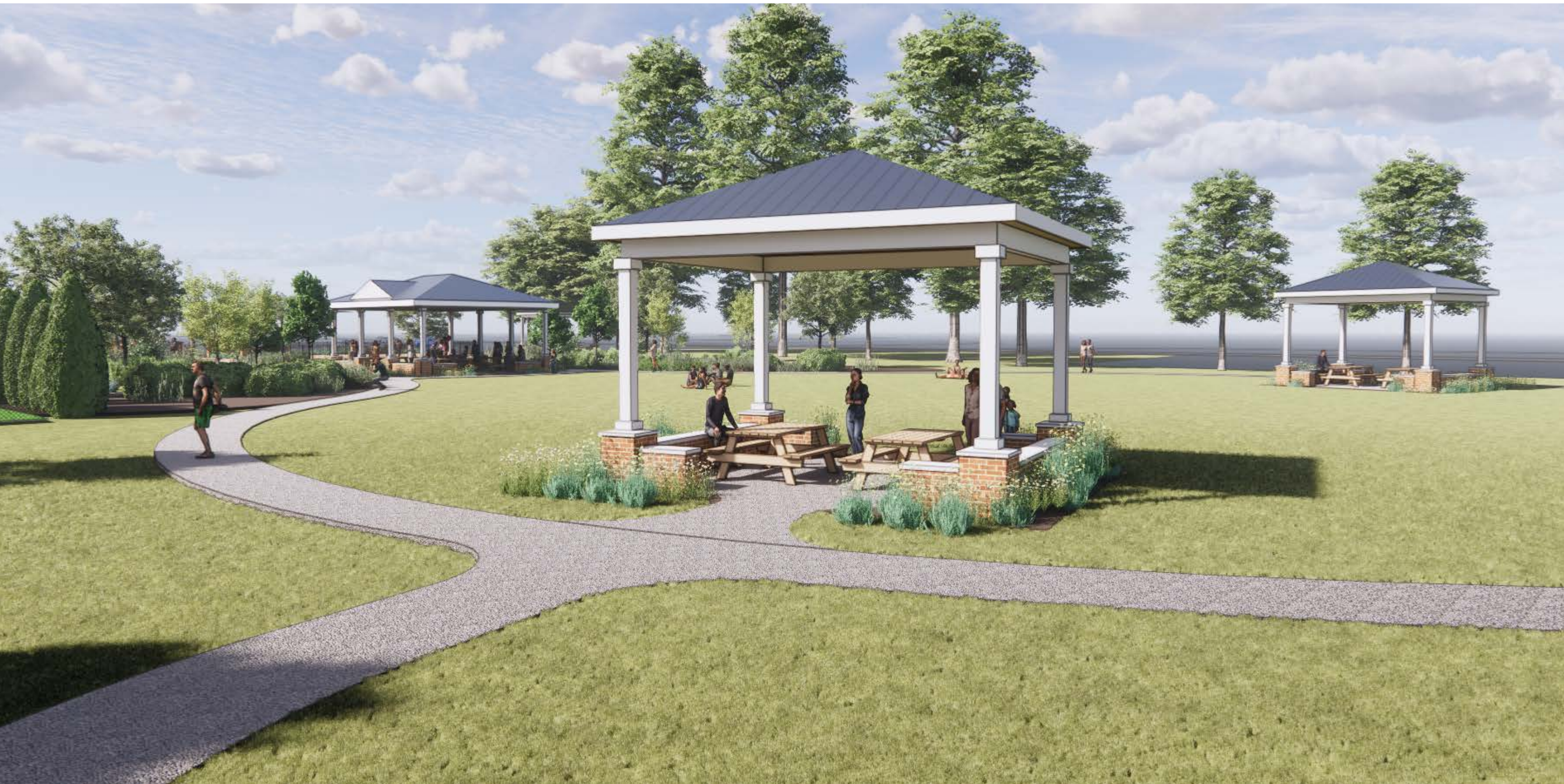
TYPICAL PICNIC PAVILION