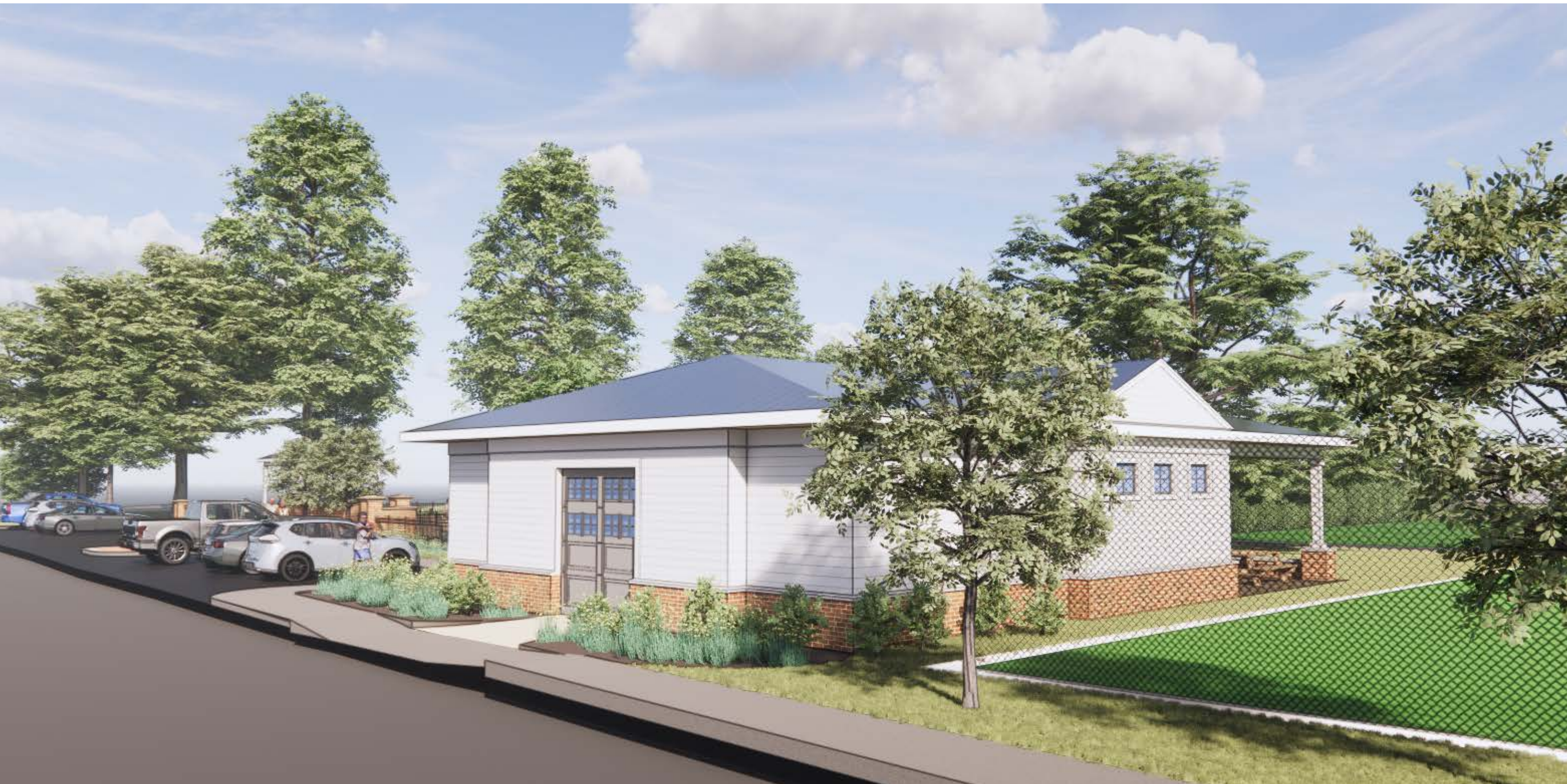
RESTROOM APPROACH ON VIRGINIA STREET