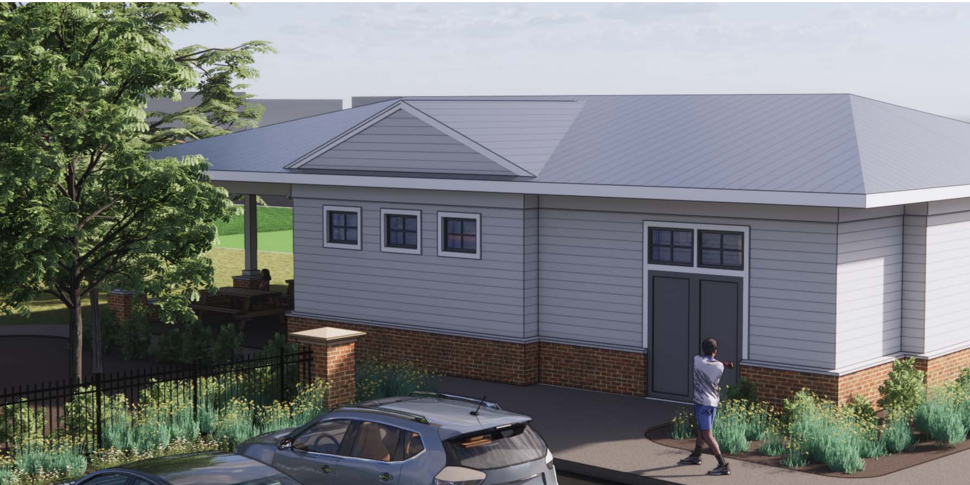
RESTROOM SIDE PERSPECTIVE