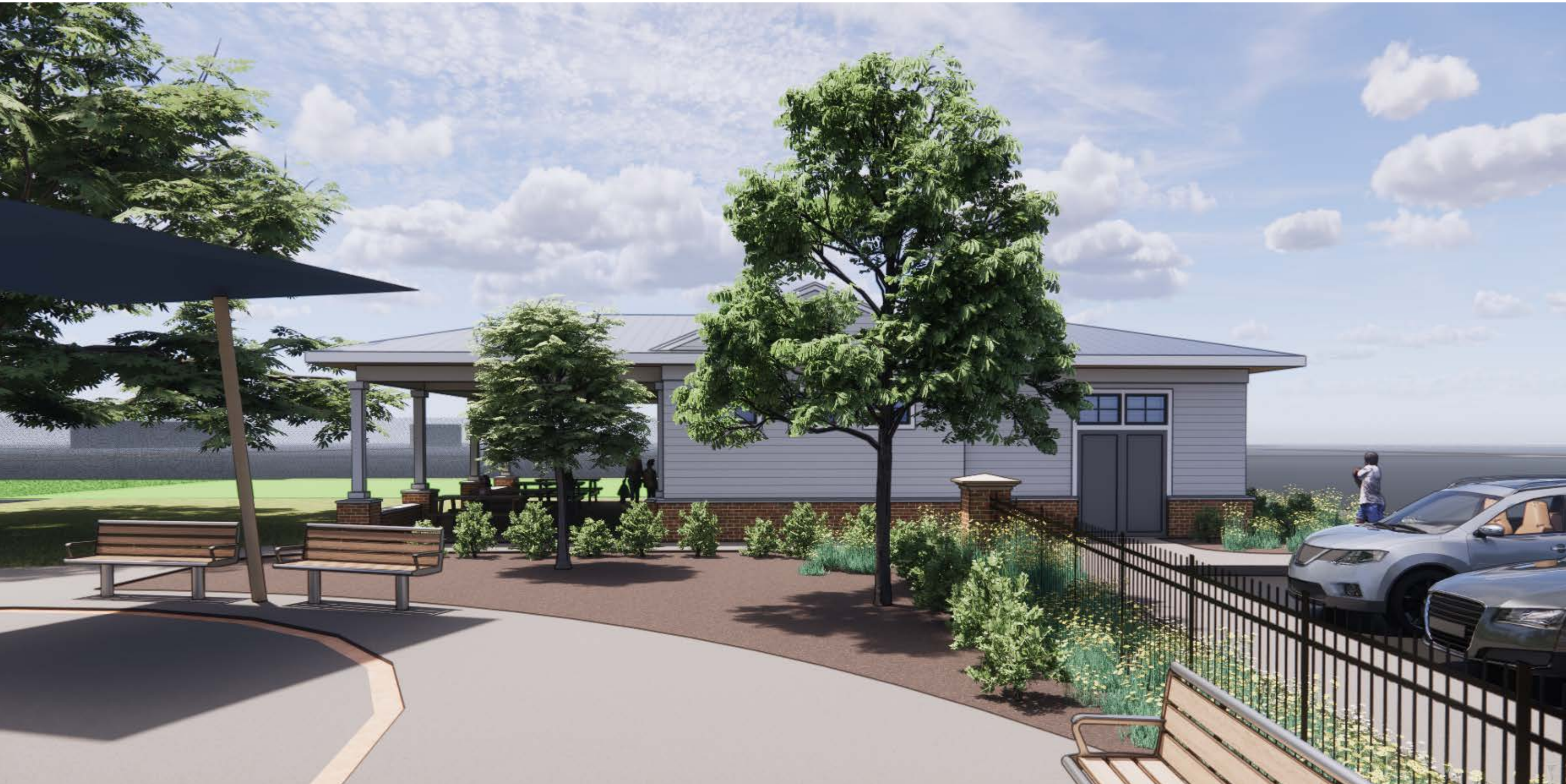
RESTROOM VIEW FROM SPLASH PARK