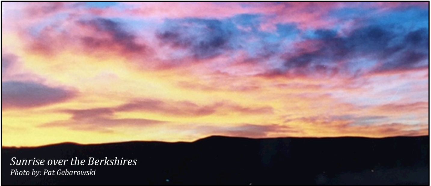
Sunrise over the Berkshires