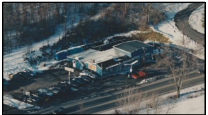
Lewis Service Center and Harry's Auto Sales