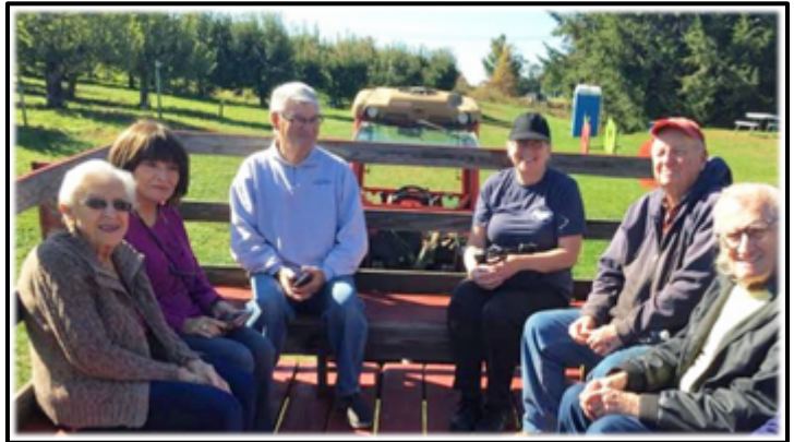
The Senior Club hayride at lakeside Orchard in October; underwritten by the Friends of the Cheshire COA.