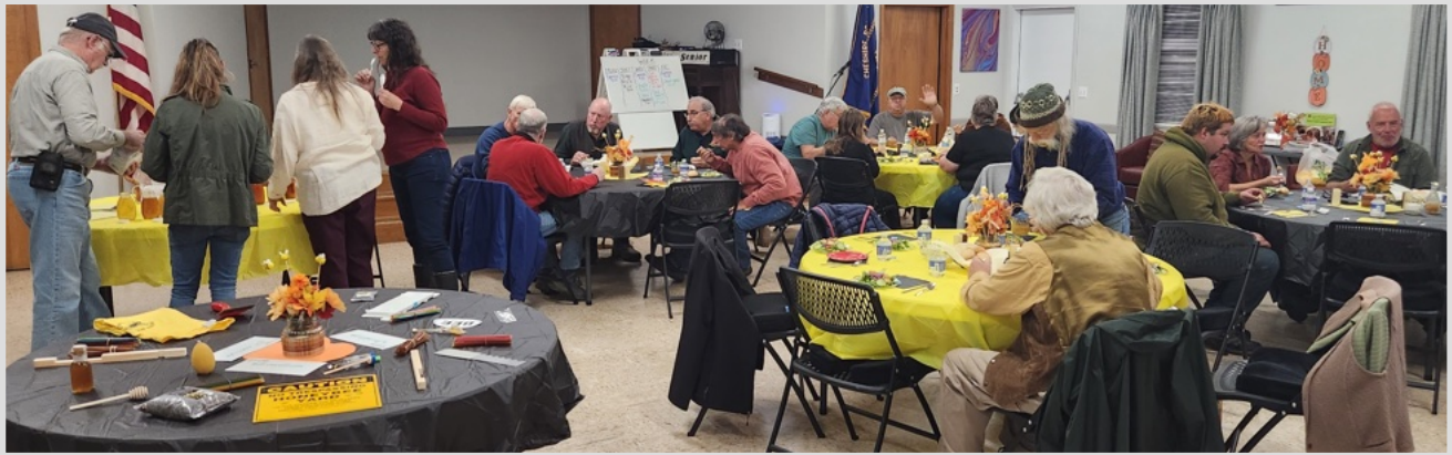
The Cheshire Northern Berkshires Beekeepers Association (NBBA) held their annual banquet and honey tasting at the Cheshire COA Center, recently.