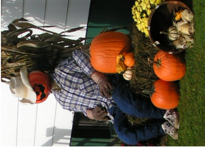
Jack O'Lantern is Guarding the harvest