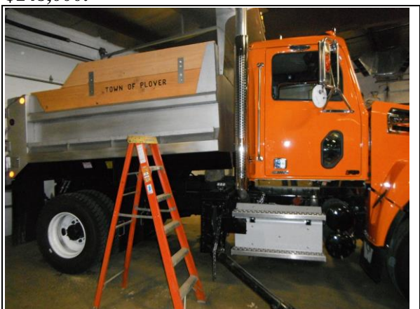
Big purchases but without having to borrow funds since budgeting over the last 10 years provided for these equipment replacements.

purchase of the 2016 Western Star for $148,000!