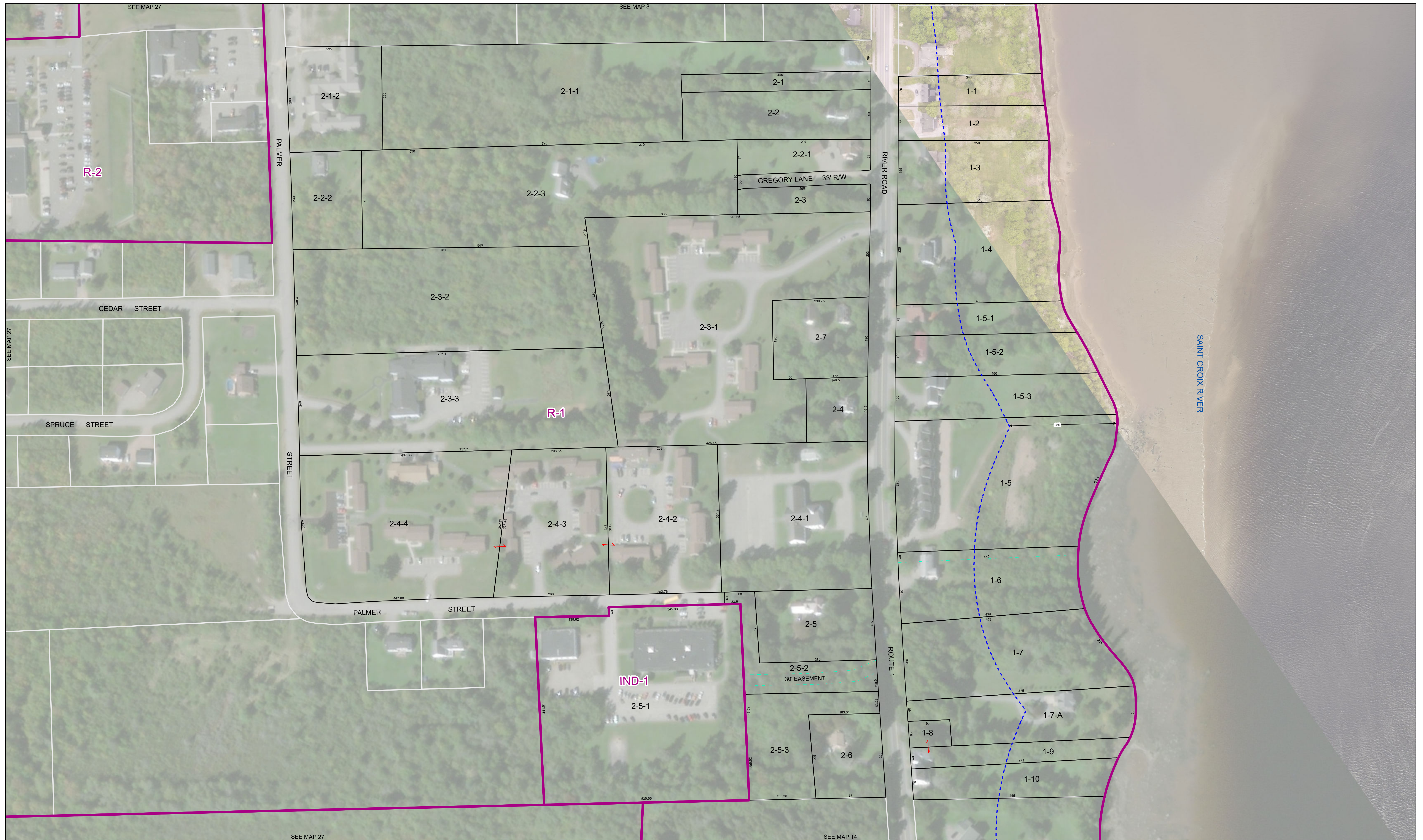
Map prepared by LatLong Logic, LLC for the City of Calais (January 2018).

Aerial Layer Credits: Source: Esri, DigitalGlobe, GeoEye, Earthstar Geographics, CNES/Airbus DS, USDA, USGS, AeroGRID, IGN, and the GIS User Community