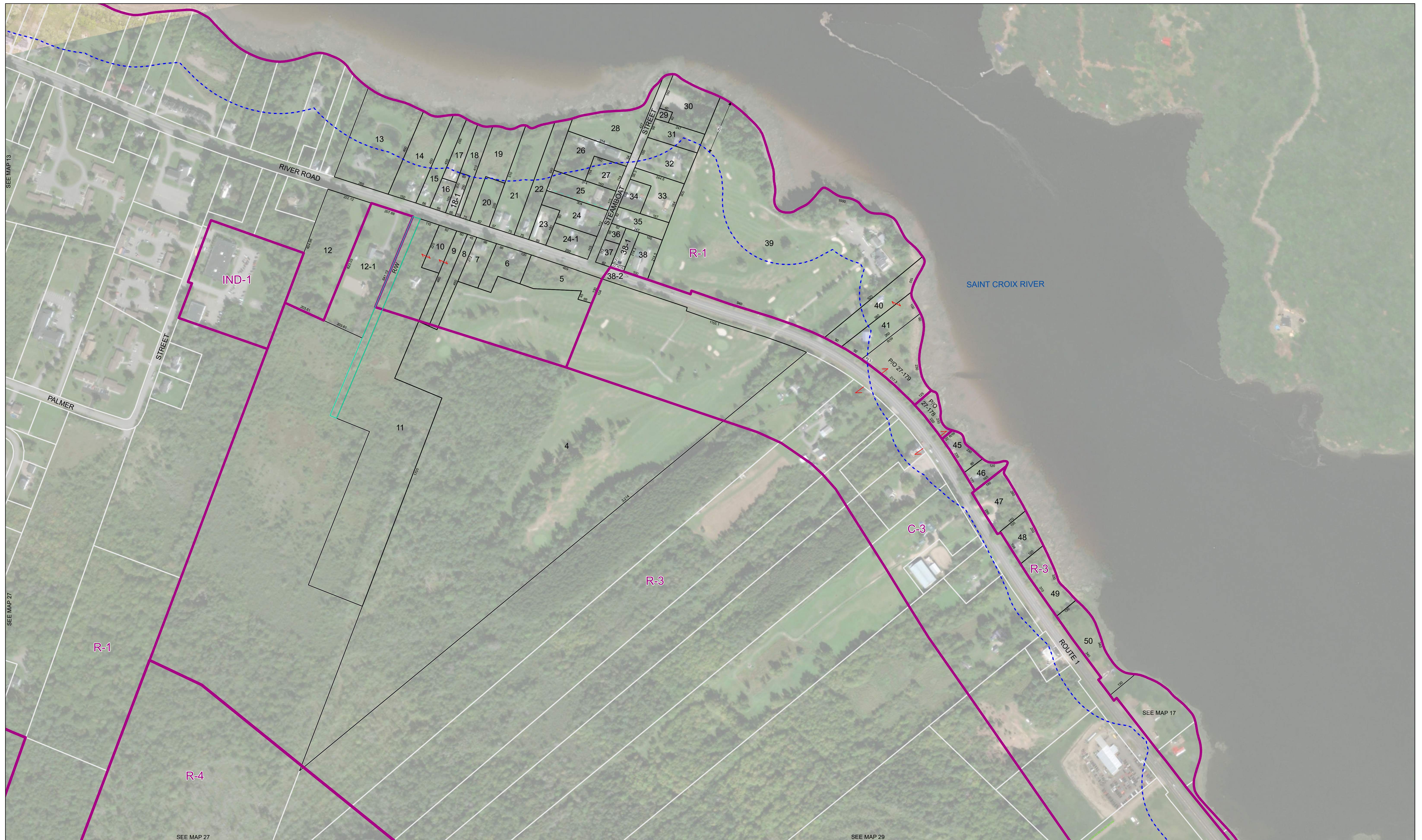
Map prepared by LatLong Logic, LLC for the City of Calais (January 2018).