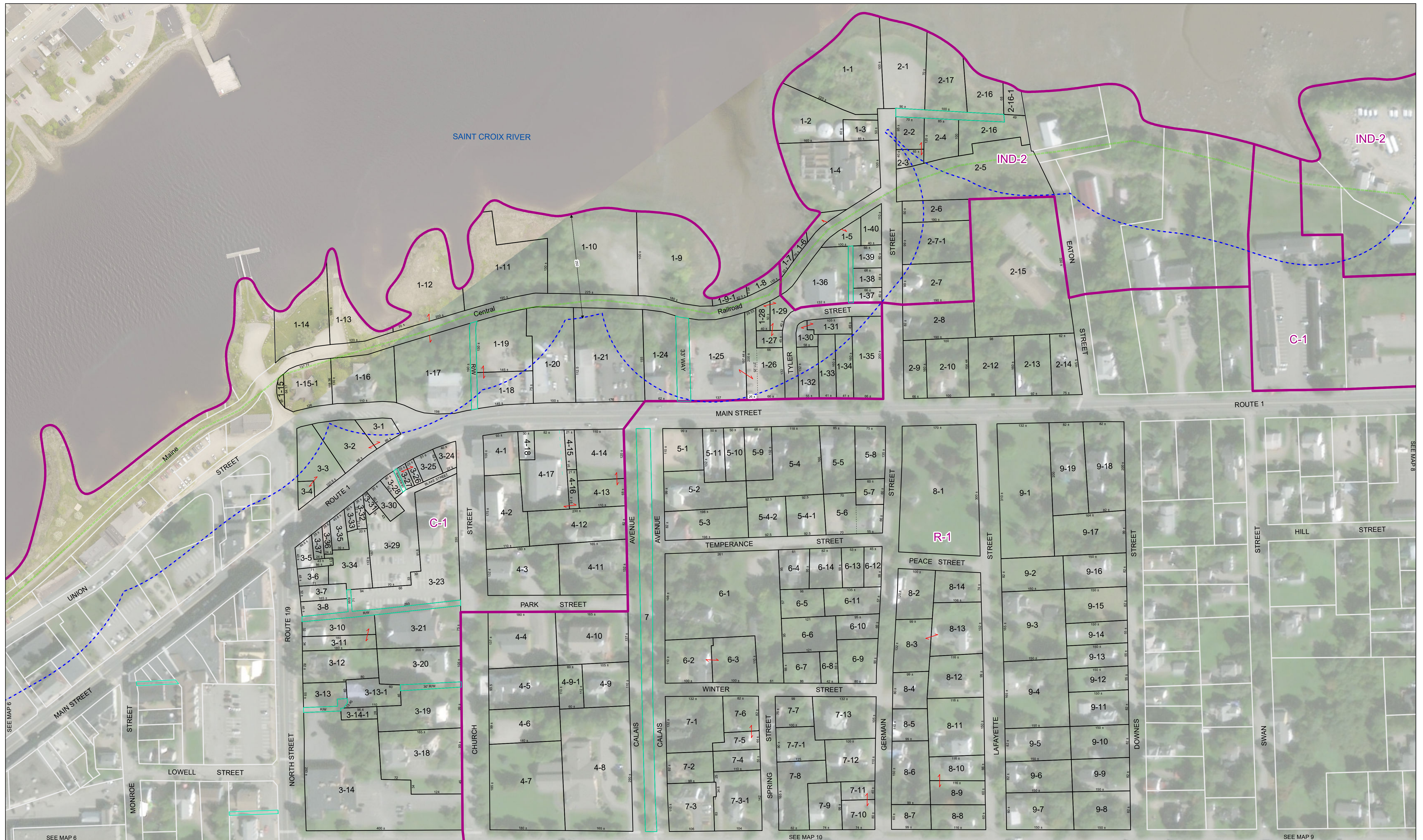
Map prepared by LatLong Logic, LLC for the City of Calais (January 2018).