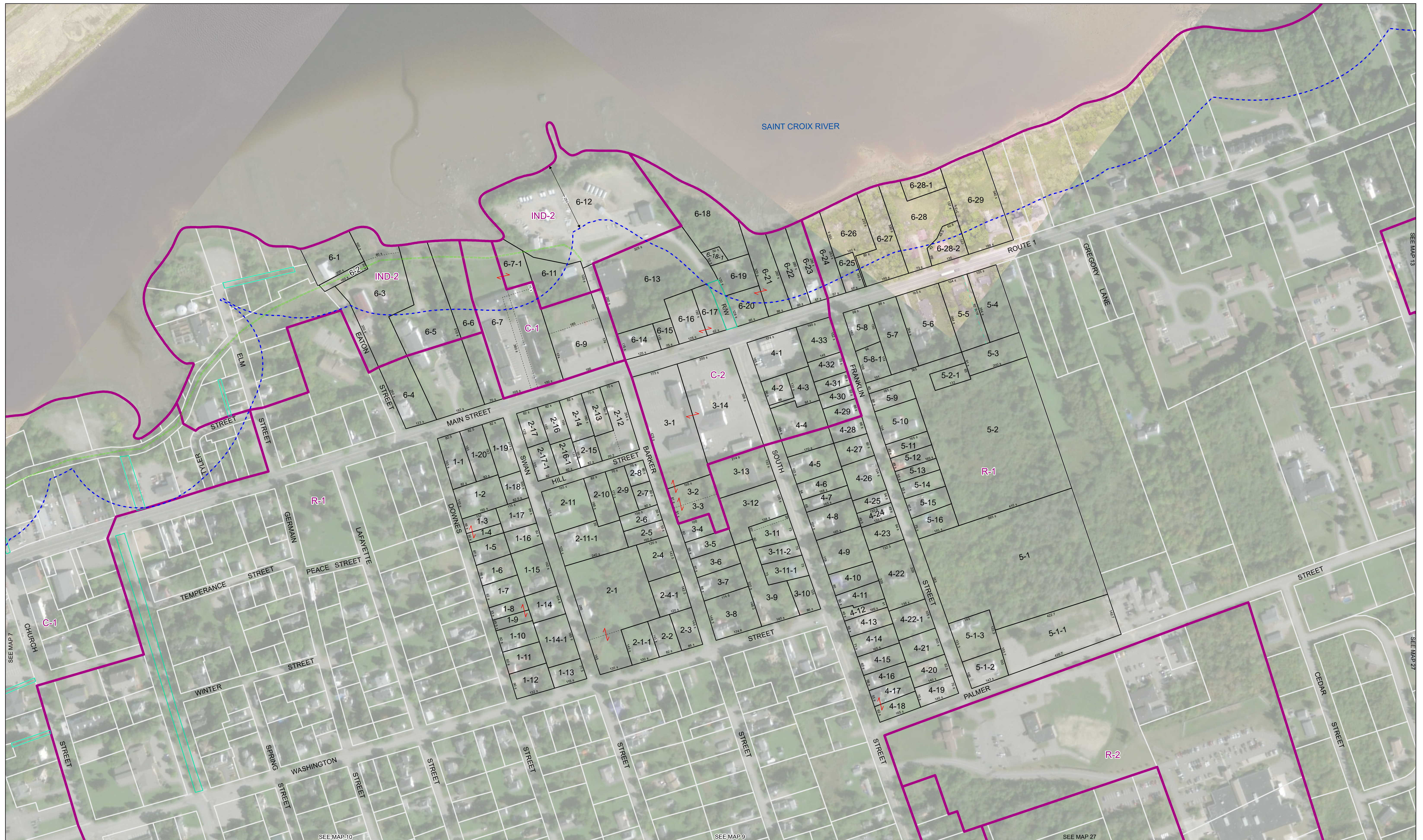
Map prepared by LatLong Logic, LLC for the City of Calais (January 2018).

Aerial Layer Credits: Source: Esri, DigitalGlobe, GeoEye, Earthstar Geographics, CNES/Airbus DS, USDA, USGS, AeroGRID, IGN, and the GIS User Community