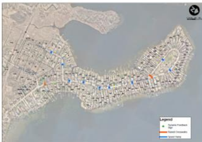
Map of Speed Hump Design (Left)