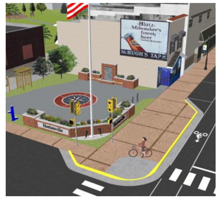
A computer rendering of Memorial Square. Some features will not be exactly as pictured.

Donating materials for a bench swing to be installed at Black Otter Park.