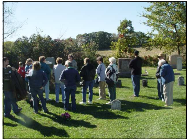
Community members toured the cemetery, which contains graves dating back to the late 1840's.