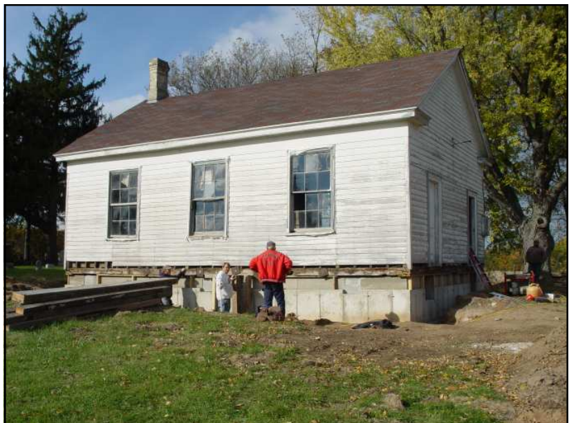
Between August and October of 2005, contractors raised the church, excavated beneath it, and dropped the building onto its new foundation.