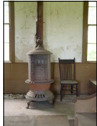
Two old stoves heated the building.