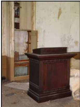
The old lectern awaits the next guest speaker.