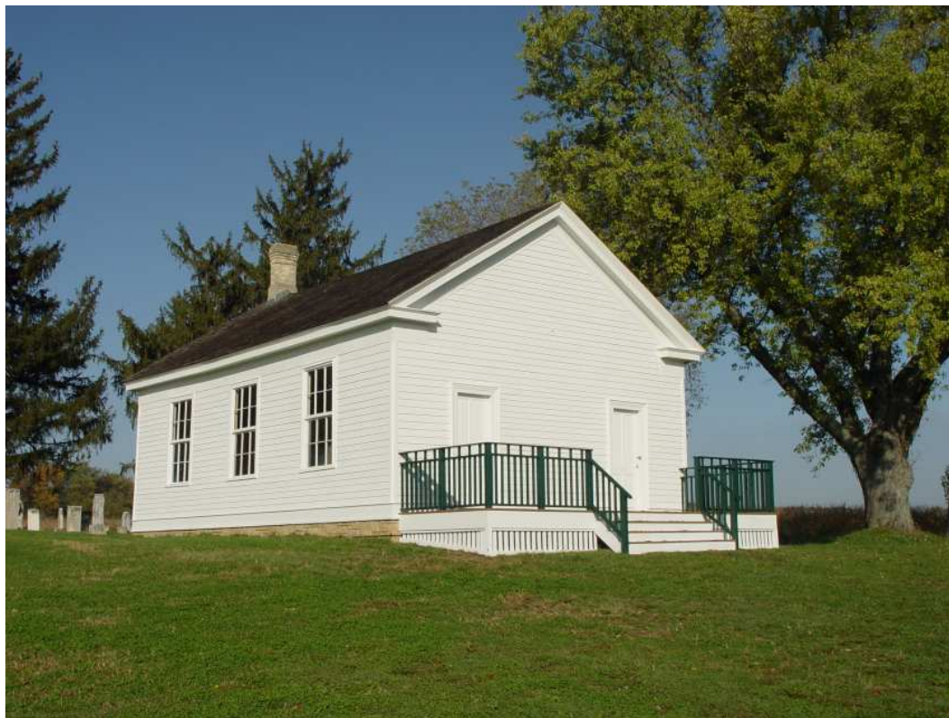
After five years of work, the exterior renovation of the Rutland Center Church is now complete.