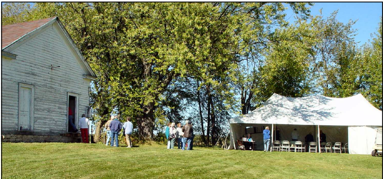
In October, 2004, a group of citizens gathered on the church property to hear about its history and discuss restoration possibilities. It was at that meeting that the Friends of the Rutland Center Church was organized.