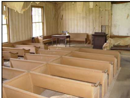
The interior of the church was in remarkably good shape.