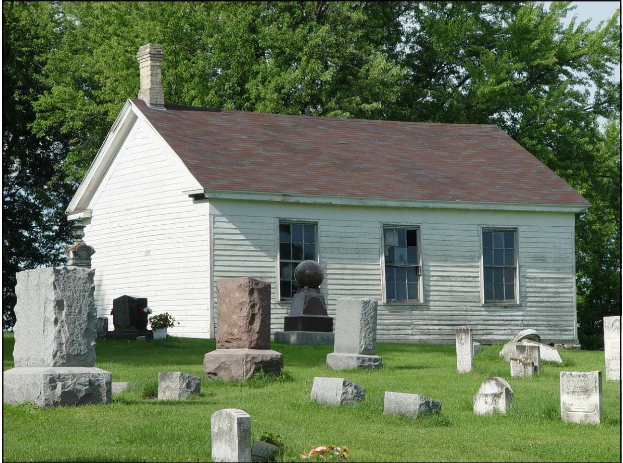
The Rutland Center Church as it looked when a local group of citizens and the Town Board decided it needed renovation. July 2003