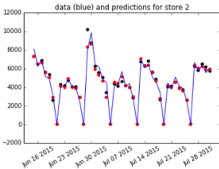
Figure 2. This picture illustrates the progress we made in this competition. XGBoost predictions without feature engineering (black) were already quite good. The improvements that full feature engineering (red) gave were really about finetuning.