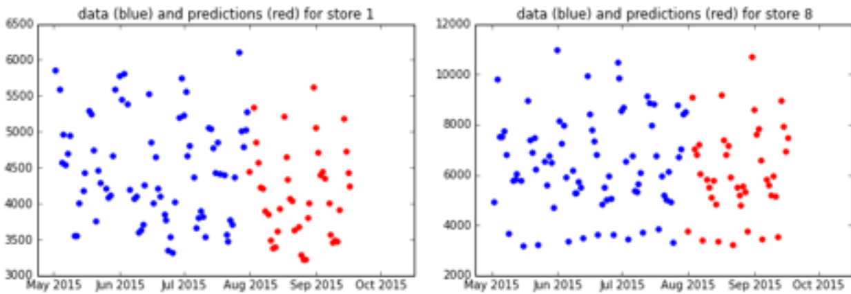
Figure 1 a/b. Illustration of the task: predict sales six weeks ahead, based on historical sales (only last 3 months of train set shown).