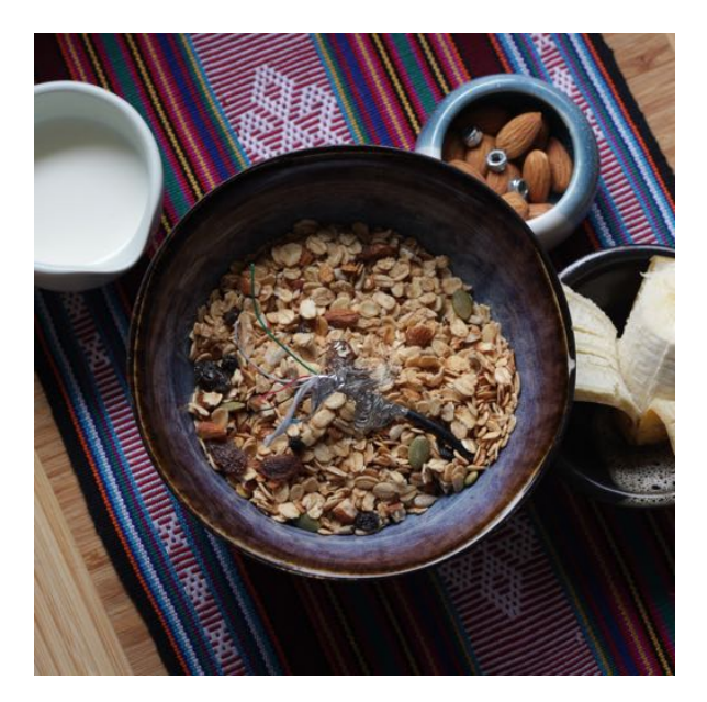
Figure 1: Toasted muesli with almonds, insulated copper wires and banana. Serve with milk or yoghurt, and a dollop of thermal grease.

Get the week off to a good start with our tongue-tingling toasted muesli (Figure 1). This meal is packed full of good-