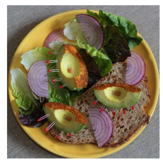
Figure 4: Avo toast. Wholemeal sourdough bread with baby lettuce, red LED lights and spiced avocado topped with a ceramic resonator.