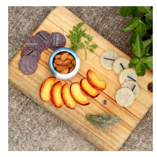
Figure 2: Platter of fresh peaches, solder headers, raw almonds, rice crackers and a 555 timer chip.