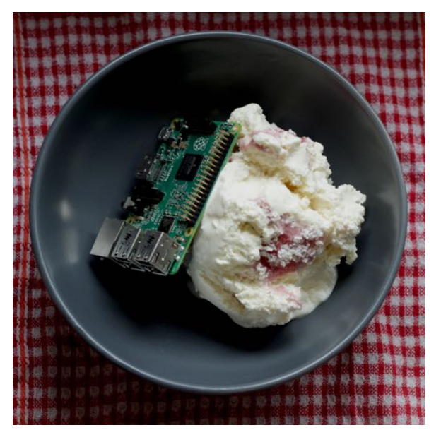
Figure 5: Raspberry whitechoc icecream and raspberry pi.

Tip: If you want to make your own bread, solder your dough to the pan for better heat convection.