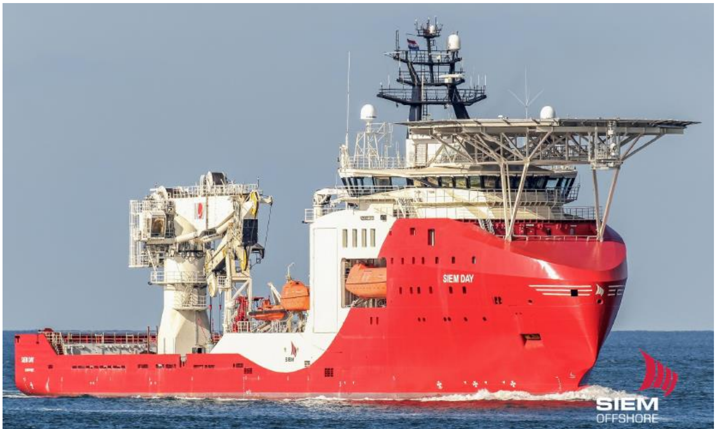
Figure 1 – North Sea Giant

The DP Construction Vessel the Siem Day will be involved in these operations.