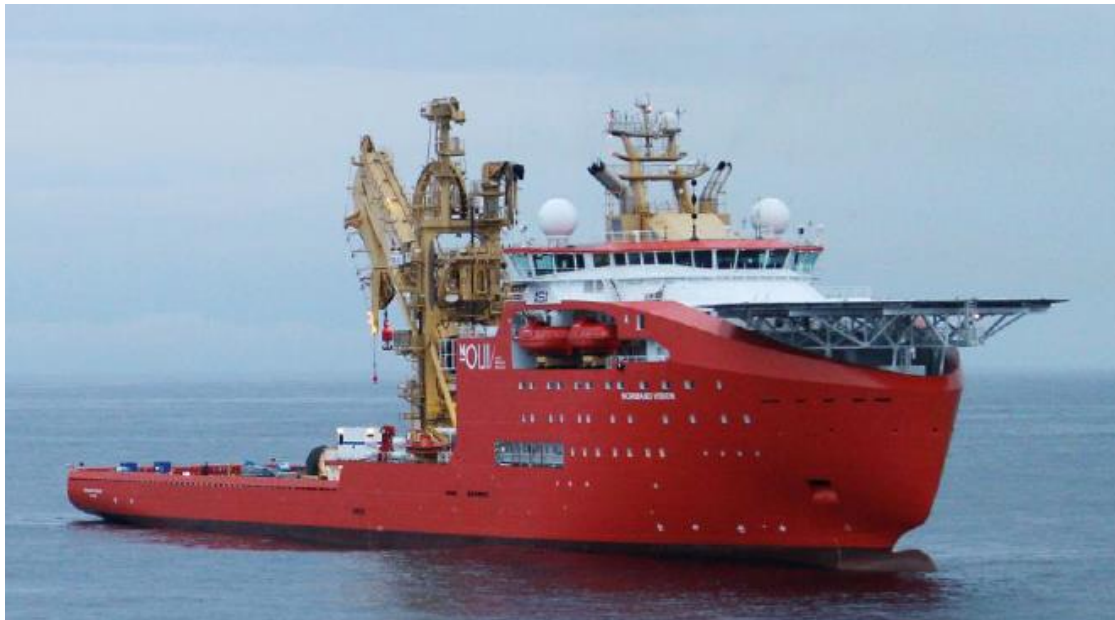
Figure 1 – Normand Vision

The Offshore Construction Vessel the Normand Vision will be involved in these operations, call sign LAQR7