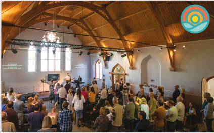
LIFE CHURCH SEAFORD