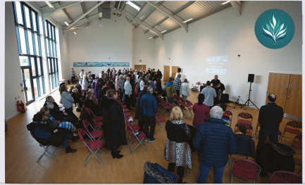
GRACE COMMUNITY CHURCH