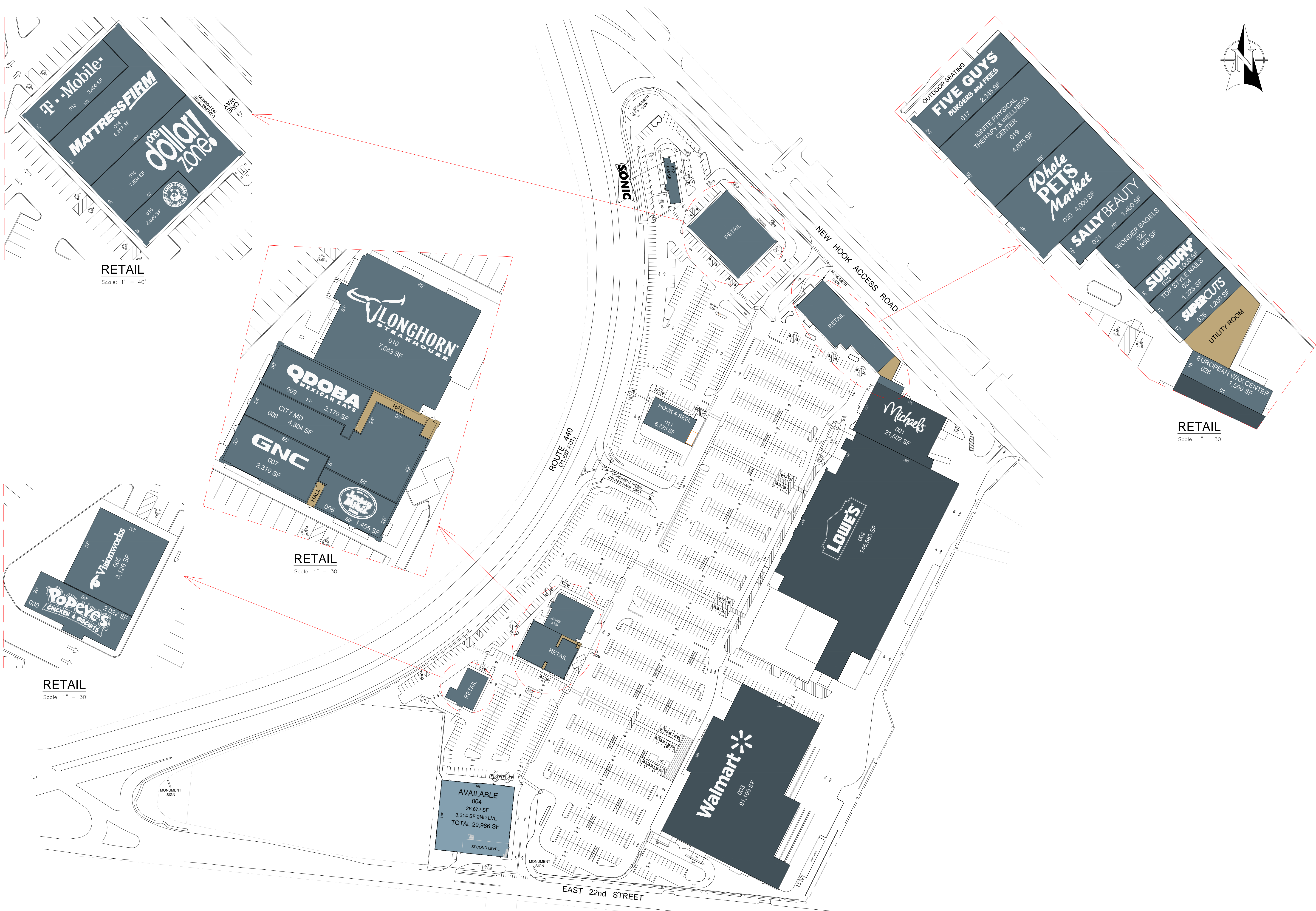
OVERALL SITE Scale: 1" = 100'