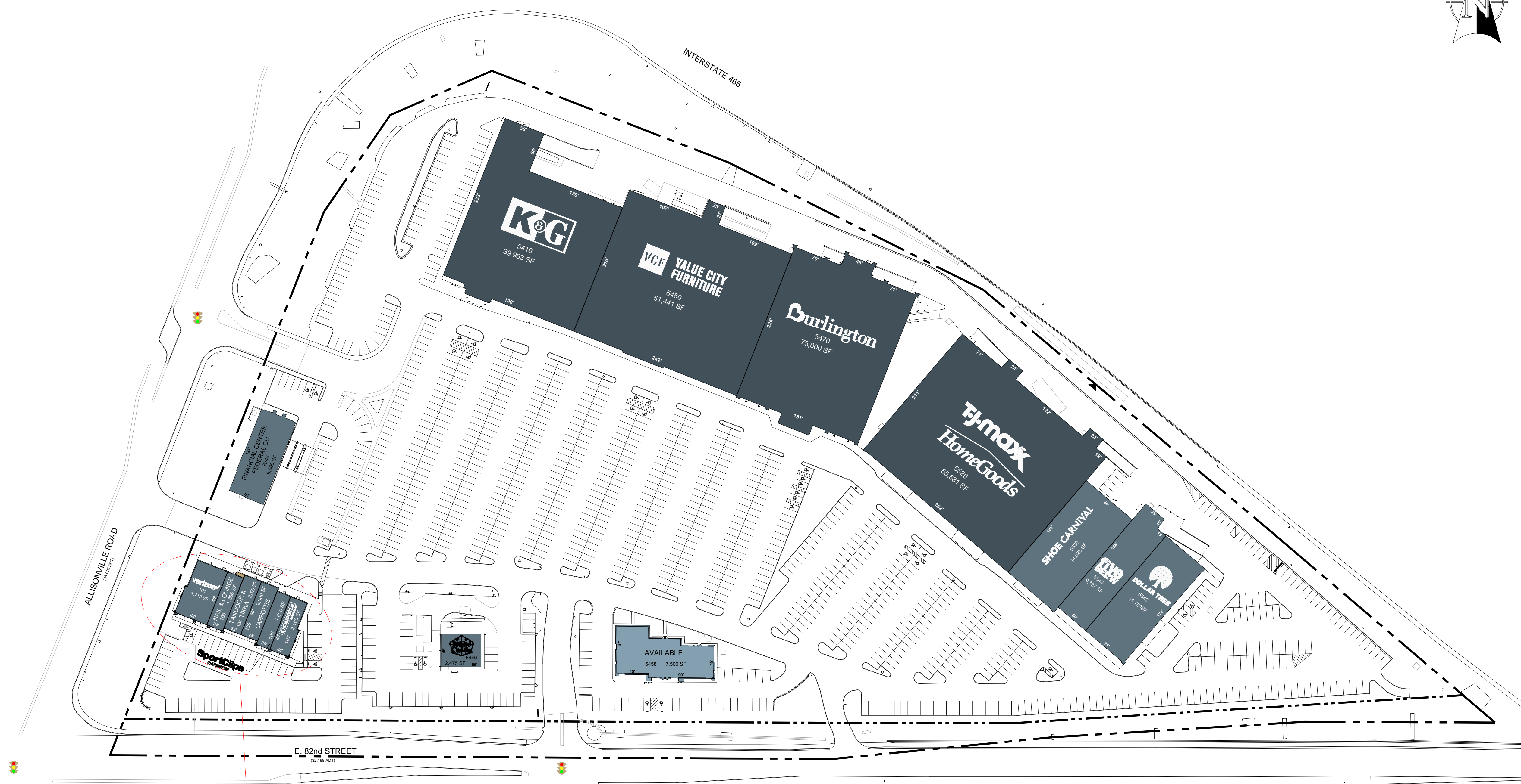
SITE PLAN Scale 1"=80'