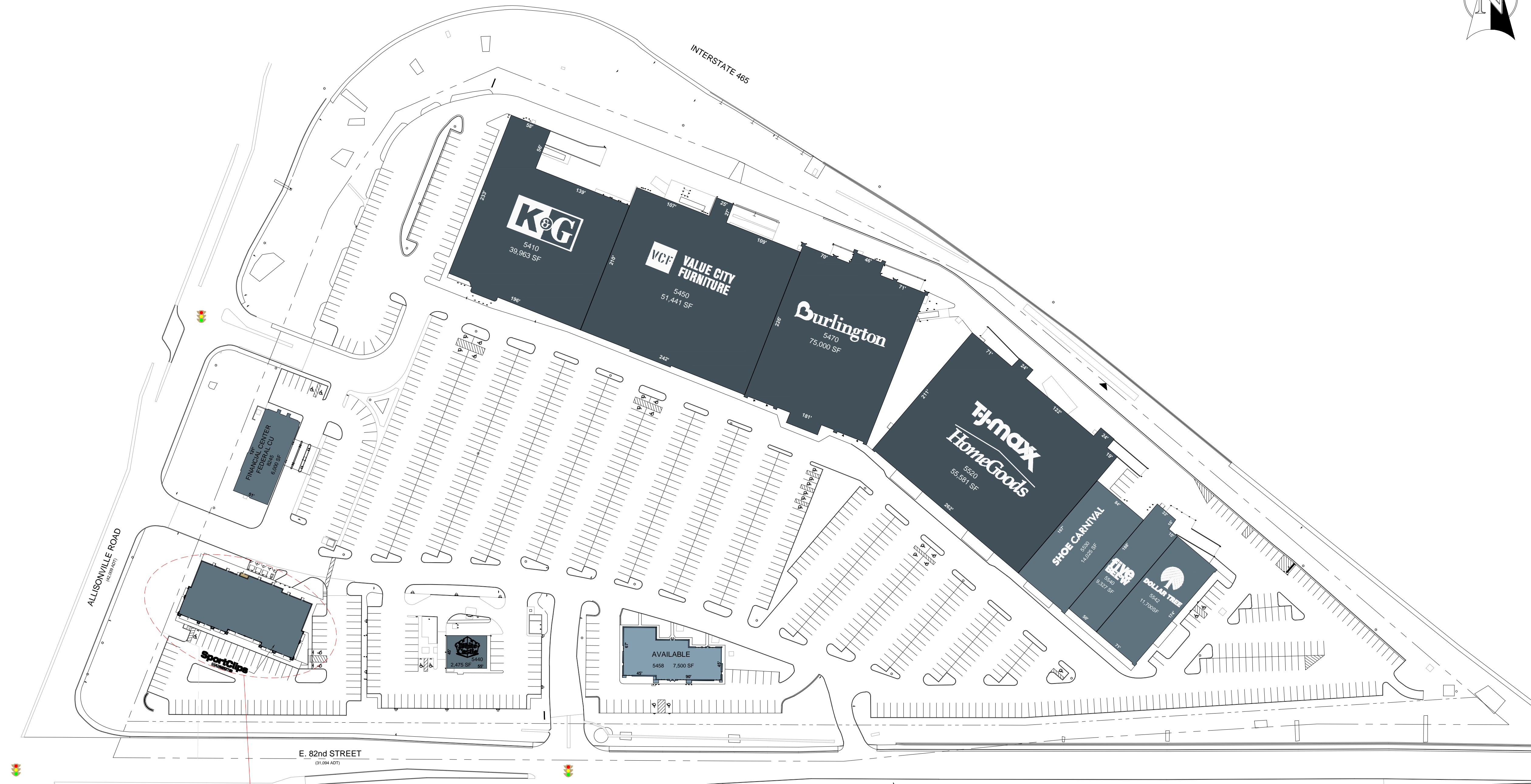
SITE PLAN Scale 1"=80'