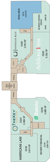
2ND FLOOR OFFICE SUITES