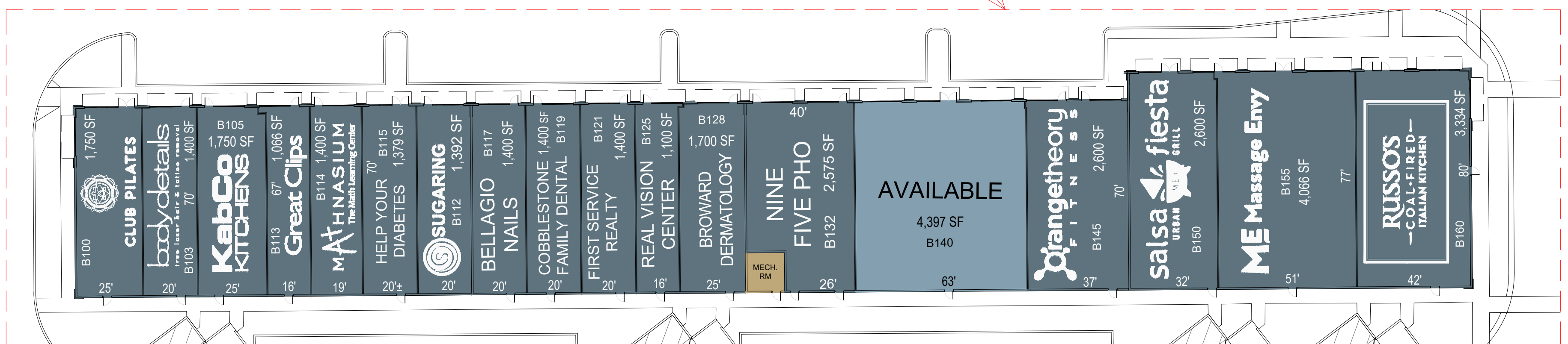
BUILDING "B" Scale: 1" = 30'