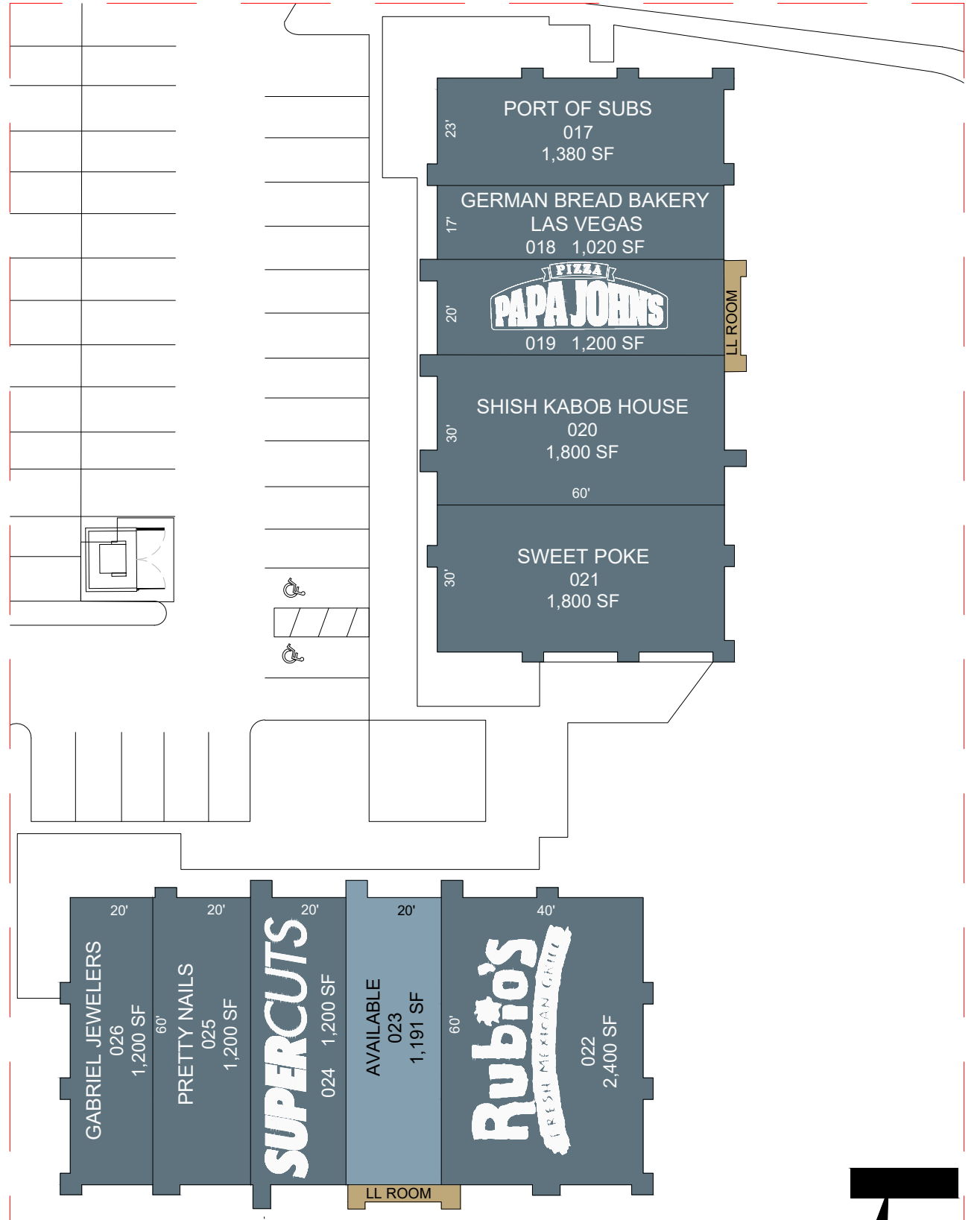
RETAIL Scale 1" = 30'