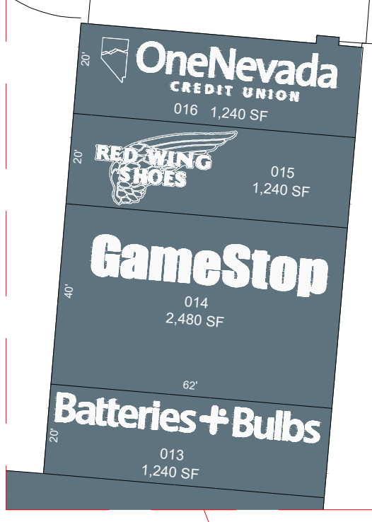
RETAIL Scale 1" = 30'