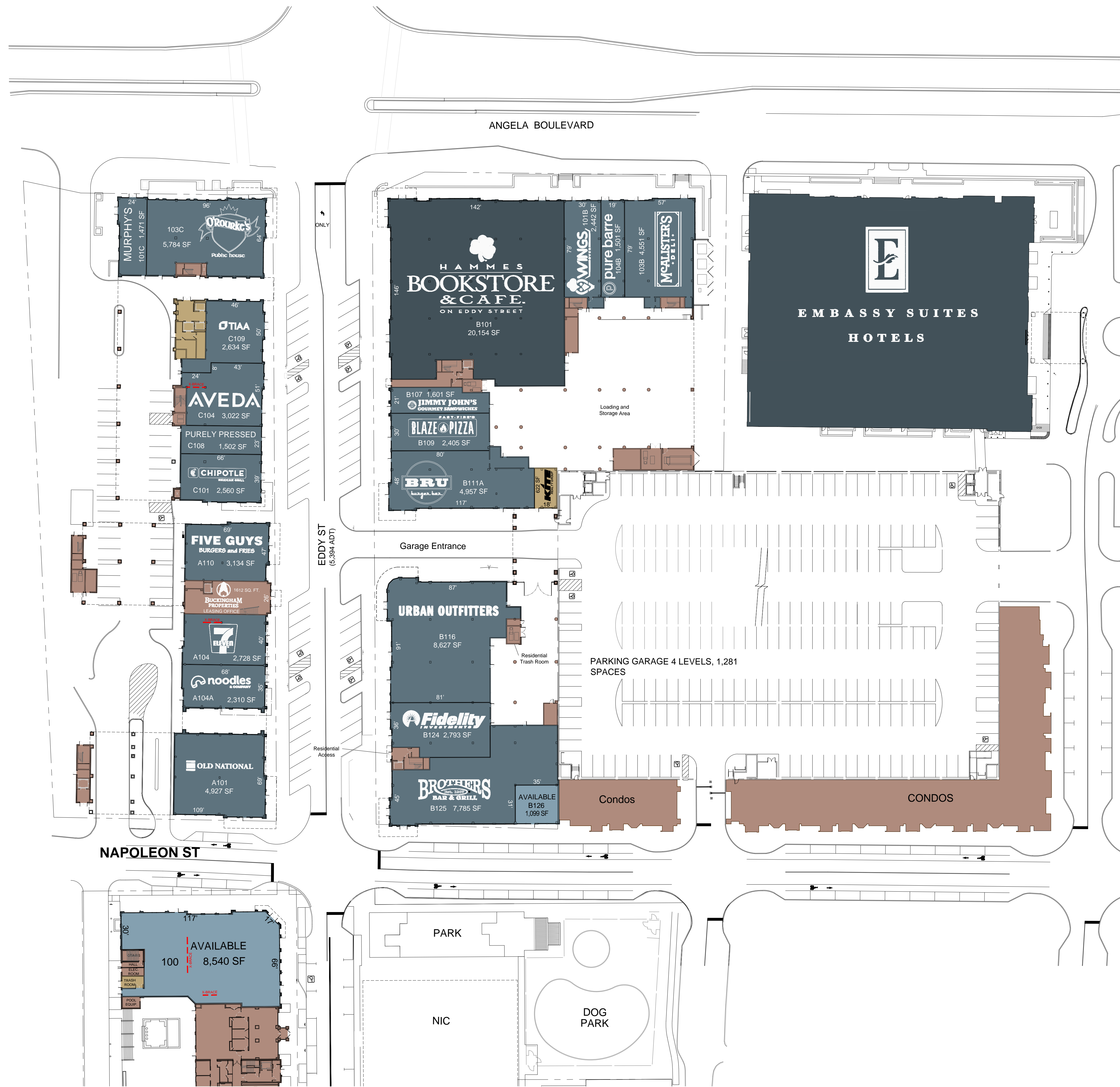
RETAIL SITE PLAN/GROUND FLOOR Scale 1" = 40'